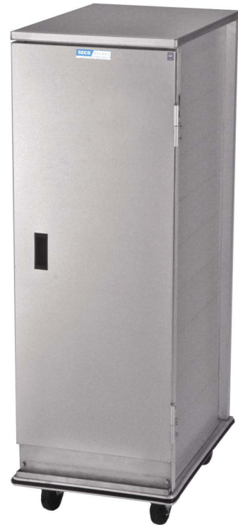
EC-1474-R shown optional perimeter bumper